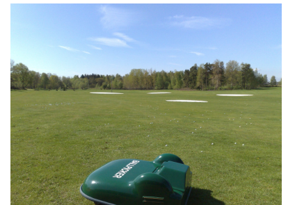
Ängsö Golf Club - Sweden

It's at the Ängsö Golf Club (Västerås – Sweden) that the first Bigmow/Ballpicker combination has been installed equipped with the Track & Trace system.