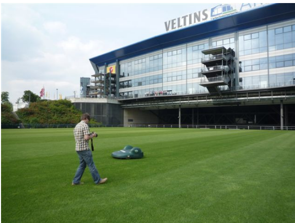
Veltins Arena - Germany

The acquisition of the Bigmow® is part of this ongoing desire for supremacy.