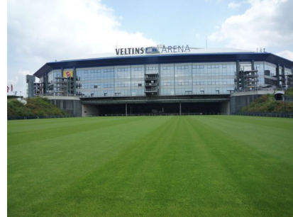
Veltins Arena - Germany