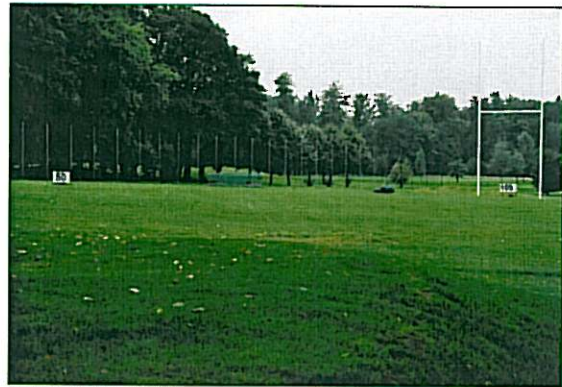
Sept Fontaines Golf Course

Four golf courses have chosen our solutions in Belgium. The golfers who frequent the Bercuit, Boisfort, Sept Fontaines and Houthalen golf courses are now used to seeing our robots trailing about, and to appreciating their silent operation.